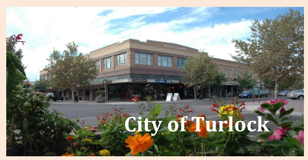
Turlock: 2nd Quarter 2019 Per Capita Sales Tax CENTRAL VALLEY REGION

2019Q2 Taxable Sales $ 340.7 million 2018Q2 Taxable Sales $ 339.4 million Percent Change 0.4%